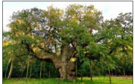
Photographs of Oak Major , winter and summer, both Credits: Wikimedia.

Trees lend themselves well to the needs of photographers with their techniques and art. Trees do not run away, hide in the undergrowth, or flap about except during storm. If a broad-leaf tree in summer is just a mass of green dots soon enough its interesting structure will be revealed. Isolated conifers can be found that display their typical symmetry, itself one of the fundamental differences between needle-leaf and broad-leaf trees.