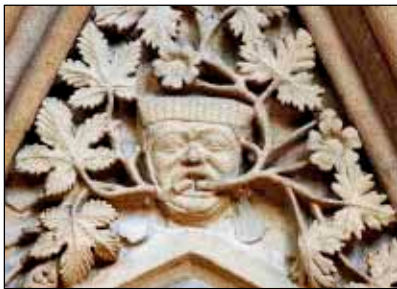
Green-man : stone carving on a church.

Losing your way in a forest easily happens. It feels the same as being in thick mist on a mountain top then realizing you have lost your compass: fearful. Distant landmarks are invisible, try one direction, try another, must keep trying! For our ancestors moving through forests following previous tracks, there were variously swarms of ants, snakes, big cats, wolves, bears, and mysterious phantoms to report to members of your clan in conversation around the cooking fire. Myths were born: a lone man living in the woods by choice, or possibly as a punishment, could easily be the source of a myth. The Green Man , or Wild-man , the Wood-wose and similar weird creatures of the forests of Europe were sufficiently harmless to become incorporated into utilitarian art. They inspired decoration on external stonework or interior woodcarving. “Green-man” became sufficiently domesticated to serve as signboards for public bar-restaurants.