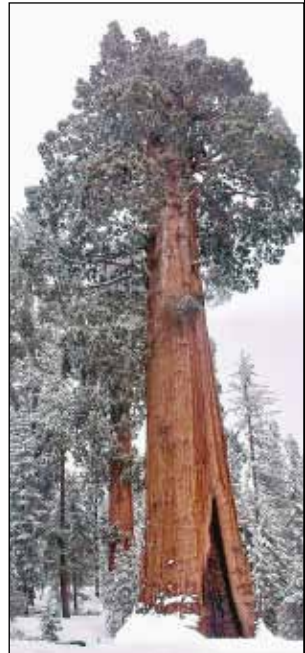
General Grant , a national shrine of the USA.