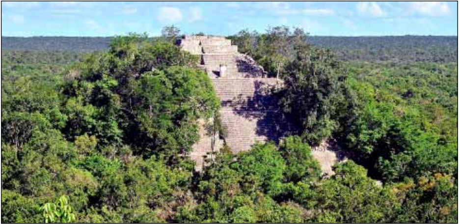
Mayan temple: Calakmul in the forest of S.E. Mexico.

walkways. These earthworks date from long ago, 10,000BP for example, but still remain visible from the air in the area now called the Llanos de Moxos (Plains of ...) in Bolivia. Many tropical forests of our world have remains of huge temples, incongruously surrounded by what is often called jungle: an uninhabitable mass of vegetation. Much archeological evidence now reveals how the peoples of these various civilizations, such as the Maya of Mexico, cultivated sufficient food to support construction of these colossal stone monuments.