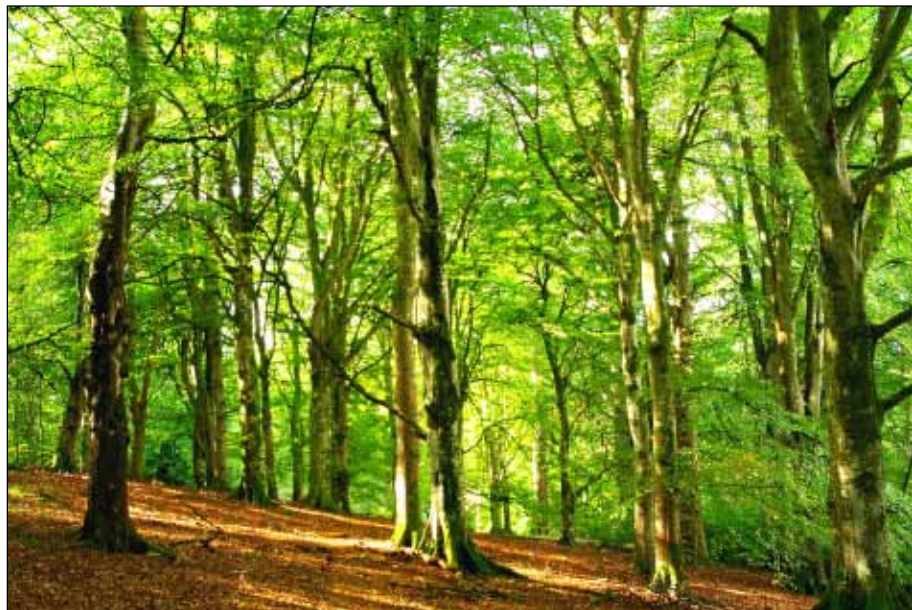
A way between sunlit trees of the forest.