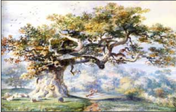
Wyndams Oak , painted by J.D.Surgey: this closely resembles the current living tree. Credit: Wikimedia.

Needle-leaf conical growth is dominated by one bud at the very top of the tree. This is the apical meristem, a class of cellular tissue dedicated solely to producing new cells for growth. Broad-leaves trees can grow in many directions, replace lost branches, and some species can continue to grow again after we coppice or pollard them. Photographs reveal all these forms better than paintings usually do.