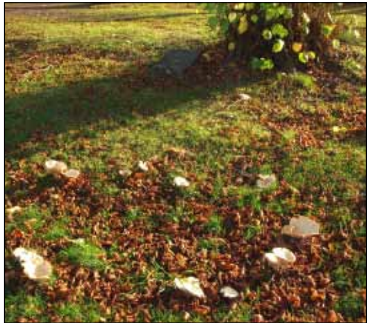
Fairy rings - mysterious and fearful. Or the mushrooms (sporocarps) of a species of fungus that is probably in mycorrhizal connection with the lime (linden) tree?

The Curupira of Brazil are like men in form except for their feet. These point backwards! Tracks that Curupira leave in the forest will lead any too-curious human away from their maker. A Curupira guards the forest with his spear as a threat to any human who mistreats or mismanages their fair share of the resources of the forest.