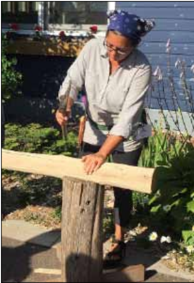
Pounding a stem of black ash to release fibres for basket making.

A pragmatic social culture of tending and harvesting trees probably started when our ancestors needed more than fuel-wood collected as fallen branches. People who first inhabited that half of our world's land-mass, the Americas, migrated from far eastern Eurasia, from the lands called Beringia. Then the level of the oceans was much lower, during the Last Glacial Period that ended 11,700 years ago. The people walked, and some may have rowed canoes made by carving and digging out logs of large conifers. By the time these new peoples reached what is now the coast of southern Alaska they were probably well pleased with the sight of several species of massive conifer trees. Now the town of Sitka is established on the coast of Alaska and the spruce tree named after it, also known as Picea sitchensis , is indigenous to a narrow coastal strip that extends along to the Canadian province of British Columbia and thence just into Washington State.