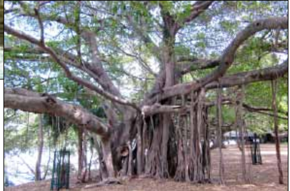
Banyan tree planted in a public park, Australia.

From recorded history onwards people are known simply to revere trees, more love for them than fear of the forest. This leads to the social designation of distinctive groves as sacred. The trees are there for the people to be worshipped. The Druid priests of pre-Christian people of Europe, such as the Celts, acted not only as law-makers and judges, but also as stores of practical knowledge of the times and effects of seasons for agriculture and silviculture. In many other regions and countries of the world there are groves, individual trees and particular species held sa-