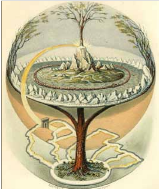
Yggdrasil.

by happenstance of climate, weather, ecology, fire and storm. We construct landscapes in our minds and even build them to our designs, as parks and gardens. From long ago we populated these landscapes with deities and with systems whereby the nature of our world, its workings could be created in our minds and explained to other people. We created cosmologies in our minds.