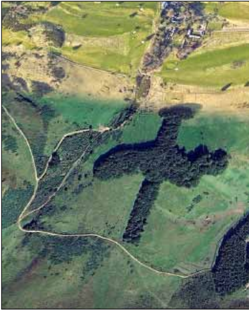
The T-wood , as a memorial or a political statement?

cred. Examples include: shimboku trees of Japan, the dangsan namu tree of Korea, and the bodhi tree of India. It was a bodhi tree under which Buddha meditated. Sacred groves of trees have a history of worship as far back as records go. They continue to be revered as fengshui woodlands of China, the sacred shrine groves of Japan, and the church-forests of West Africa. Giant sequoia trees of North America are viewed by many awe-struck visitors who travel far to stand beneath them, staring far upward in amazement. The famous individual sequoia , 'General Grant', was named as the USA's Christmas tree by President Calvin Coolidge, then promoted by President Dwight Eisenhower as an official national shrine.