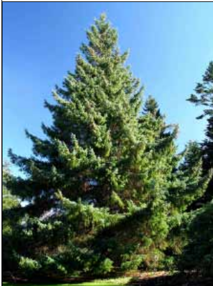
Sitka spruce in its natural symmetrical cone form growing in a botanic garden.