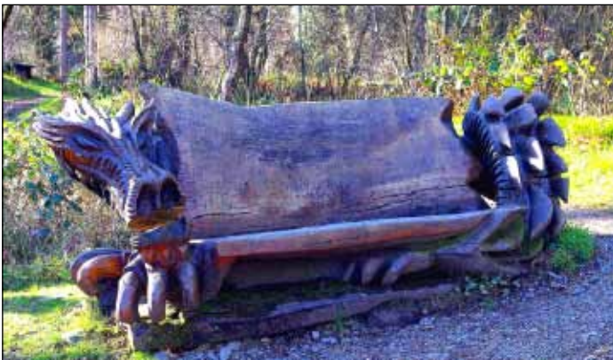
Dragon carved as a bench in a woodland nature reserve.

A major theme of European mythology and art of woodland derive from stories written by Ovid, the poet writing in ancient Rome. His many tales under the title Metamorphoses , as change from one state of form to another, are often the subject of recent European art. Well known of these stories is the infatuation of the god Apollo , with the woman Daphne . But she loved more deeply the trees and woods through which she wandered and wished to spend her life amongst. The more Apollo persisted in his courting of Daphne the more she metamorphosed toward the form of a tree: her fingers sprouting leaves, her arms becoming branches.