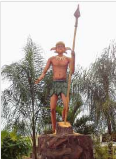
Curupira , in Brazil.

people as a pagan deity in the form of a man able to disguise himself as any other person, of any stature, giant or dwarf. The further back in time these deities of the forest are found the more frightful they are. Forests of north eastern Europe are home to Laumes . These take the form of goats, dogs, or bears. They may be chimeras: half-woman, half goat. One-eyed like Cyclops , crooked of spine, and a particular threat to men unwise enough to enter a particular deep recess of the forest. Forests are home to many smaller inhabitants of ambiguous character and intent. Fairies: usually benign but also mischievous, and what about goblins?