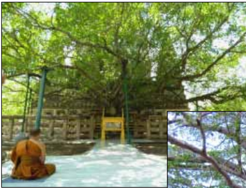
Bodhi tree , of Buddhism.

Trees not only provide us with a feast for our eyes, also literal feasts of densely nutritious fruits and seeds as nuts and berries. Hazel trees produce good crops of the nuts that people can use as instant source of food for people, and which can also be stored as reserves for hard times. The trees respond well to coppicing that produces thin supple new stems that we use as withies for fencing and building work. Some species of trees have particular scents and aromas: myrrh and frankincense as gifts in the New Testament of Christianity are from gums of certain trees. Myrrh comes from savanna trees of the genus Commiphora whilst frankincense is extracted from trees of the genus Boswellia .