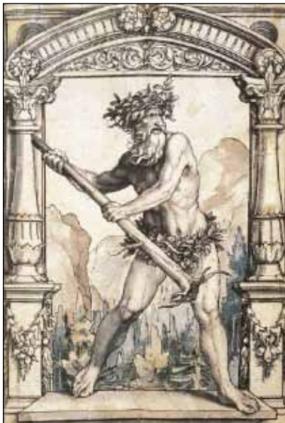
Wild-man or Wood-woose.

Evidence of how we lived then points to early days living in the wooded savannas of eastern Africa. Here the sun shines brightly overhead onto open woodlands. A sense of direction is usually easy to maintain when moving through such terrain. Then as we dispersed, over vast spans of time into northern lands, we found trees there closer together and the sun was less often clearly visible. The further north we colonized Earth the more we encountered dense stands of winter-green trees and starkly leafless or storm-broken broad-leaves.