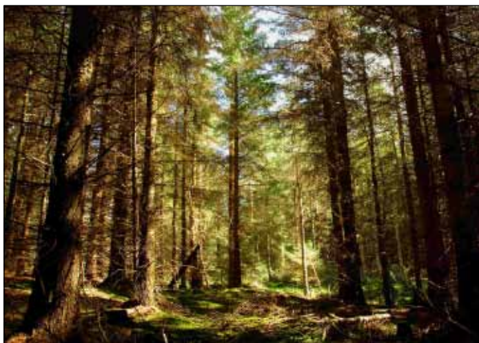
A thick forest of tall trees with useful wood products, but gloomy to enter, difficult to walk through and easy to become lost in.

We discovered how to make and control fire. Then we discovered how much tastier and nutritious food is when cooked. With that fundamental invention of cooking we took our first step leading to our current technological lives. Soon enough in evolutionary time we learnt how to cut branches and tree stems, and to manufacture charcoal. We are creatures of the wooded savannas, the woodlands, and the forests. The way we live now and use, manage and relate to trees and wooded land is rooted in this early history of our ways of securing food and shelter.