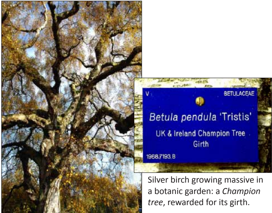
Silver birch growing massive in a botanic garden: a Champion tree , rewarded for its girth.

of such woody material for weaving. Suitable individual trees, thirty to forty years of growth, are selected for the felling of a single tree. As cut logs the wood is processed to yield fibres, both long and flexible, for weaving. This is done by pounding the log with the blunt face of a hand-axe. Gradually a mass of long fibres of the xylem tubes appear under the hammering. These fibres are processed further for weaving by hand into strong durable baskets, much in popular demand. Similarly in Europe, strips of oakwood about twenty millimetres wide are cut off a log using a spokeshave tool. These are sufficiently flexible to weave into baskets: in demand as essential equipment for gardeners and horticulturists.