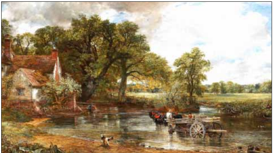
The Hay Wain , by John Constable, 1821.

A well known botanist and author of many books about trees once asked ‘Can artists draw trees?’ His answer was along the lines of trees being almost impossible to portray accurately in the sense of the mechanism of a camera that records much fine detail. This has been a problem for many landscape artists over long times, many eras, and specially in Europe and North America where landscape painting without trees, except for sea-scapes, would be problematic, or not fit for sale. How many artistic representations of prairies, savannas, moorlands are there?