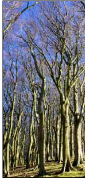
Beech trees in the T-wood ; not planted for timber production.

A grove or a distinctive wood may be created as a memorial or for other symbolic motive. An example pictured above is locally known as T-wood , from its shape as seen from downhill. It was planted, in the 1760s, in a Greek cross shape (not in crucifix form). Entirely of beech trees, which are not native to this area: they must have been imported from afar as saplings, in huge number. There are two versions of why the own-