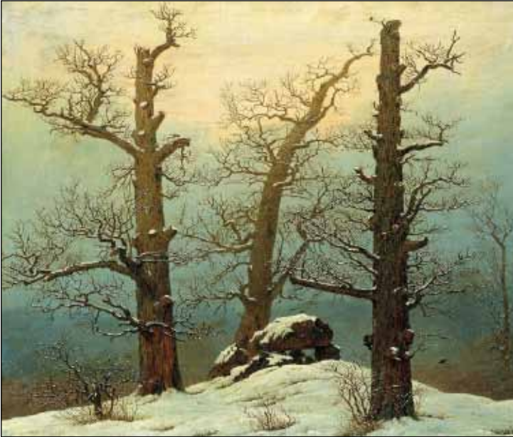
Cairn in Snow , by Caspar David Friedrich.

at right, close to the river has the characteristic up reaching branches of a black popular. For leaves a layering method is used, with only the outermost represented distinctly, in bright green, by a few strokes of a fine brush. Deeper in the leaves are represented by paler shades and less distinct brush strokes. An alternative is line-art, using pencil or ink, or painting of leafless trees, to finely reveal distinctive forms and textures.