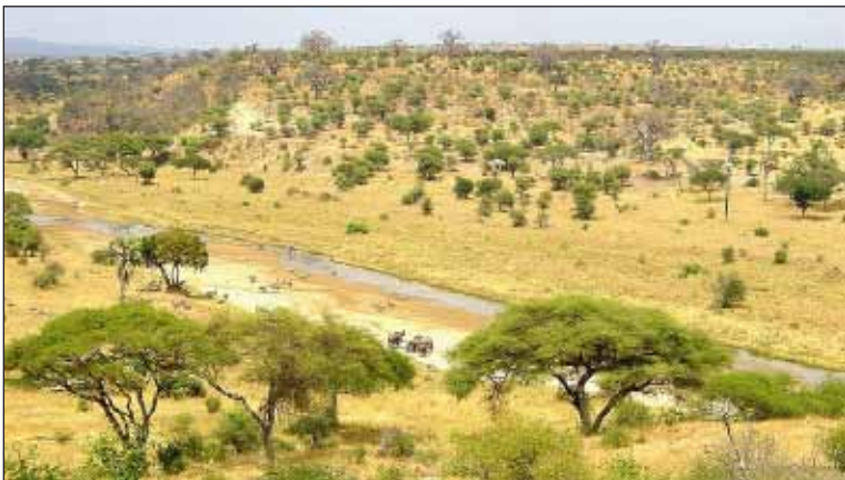
Treed savanna in East Africa, thought to resemble the environment that we people evolved in as Homo sapiens .

We people are descended from a line of creatures, the sort called primates, who spent most of their time up in the trees. They were inhabitants of woodlands and forests. There they found food as leaves and fruits, also refuge from predators, but may have lived in fear of leopards – adept at tree-climbing. Probably these ancestors resembled modern chimpanzees, with strong arms, highly mobile at the shoulder and equipped with dextrous fingers and large, highly mobile, thumb. We retain this physical inheritance that has allowed us to become the tool-using primate. Our next huge evolutionary leap was to walk and run upright; to run upright as long as it took to wear down our prey. So now our time as arboreal creatures seems to have blessed us with affinities with trees. They fascinate us and our love and sense of connection with trees is different from how we feel toward any other kind of plant.