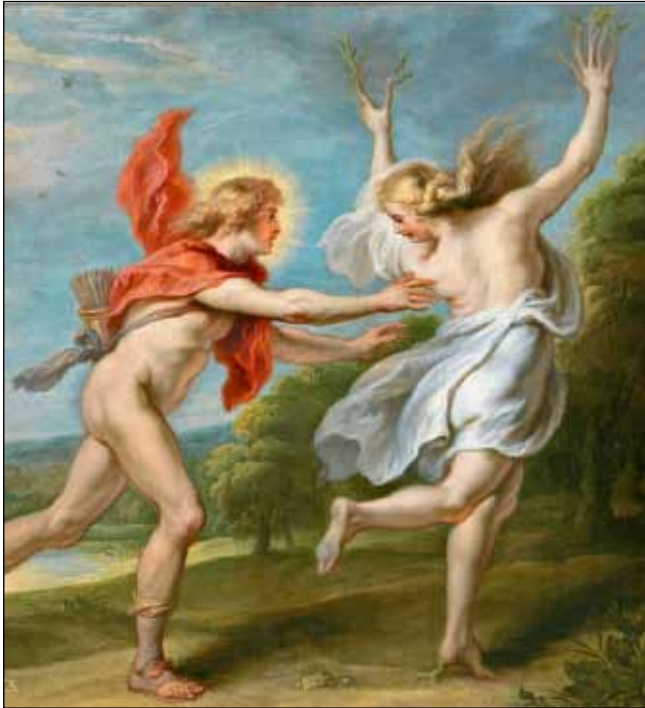
Apollo chasing Daphne: leaves sprouting from her hands and feet. By Theodor van Thulden.

er of the stock farming pasture on which T-wood stands had this grove planted. As a memorial to a family member fallen in battle, or as a political protest against the government of the nearby city who sequestered part of that landholding to make a large reservoir for drinking water. A potent gesture in either case. This fine stand of a beautiful species of tree will probably remain here long into the future.